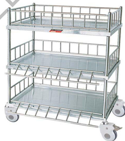
BSS204 stainless steel diaper trolley