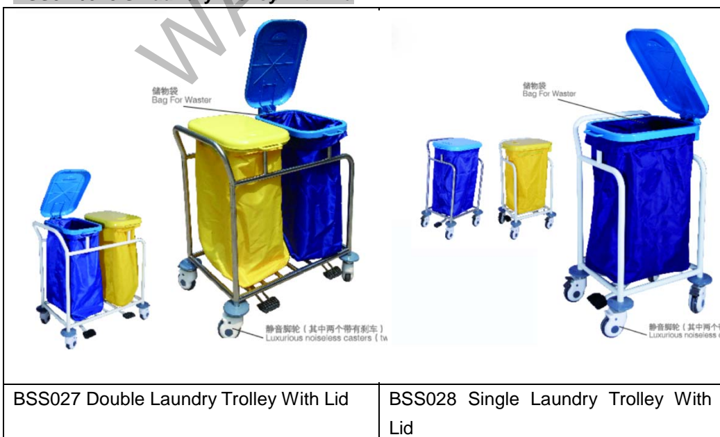
BSS027 Double Laundry Trolley With Lid